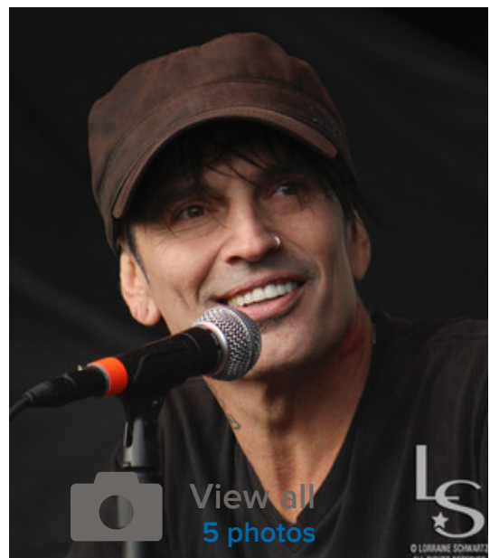
Motley Crue reveals summer tour plans at a press conference held at the Bamboozle Festival 2011

Just before their set at Bamboozle this past Sunday, rock legends Mötley Crüe held a special press conference to announce details of this summer's tour with fellow monster glam rockers Poison and New York Dolls. As fans gathered around the Temple of the Boozle stage, singer Vince Neil , drummer Tommy Lee , guitarist Mick Mars and bassist Nikki Sixx announced their setlist and stage design. But perhaps most importantly, they revealed what Tommy Lee's plans are for his always anticipated drum solo. From the sound of it, he will not disappoint. In fact, he will raise the bar even higher this time around.