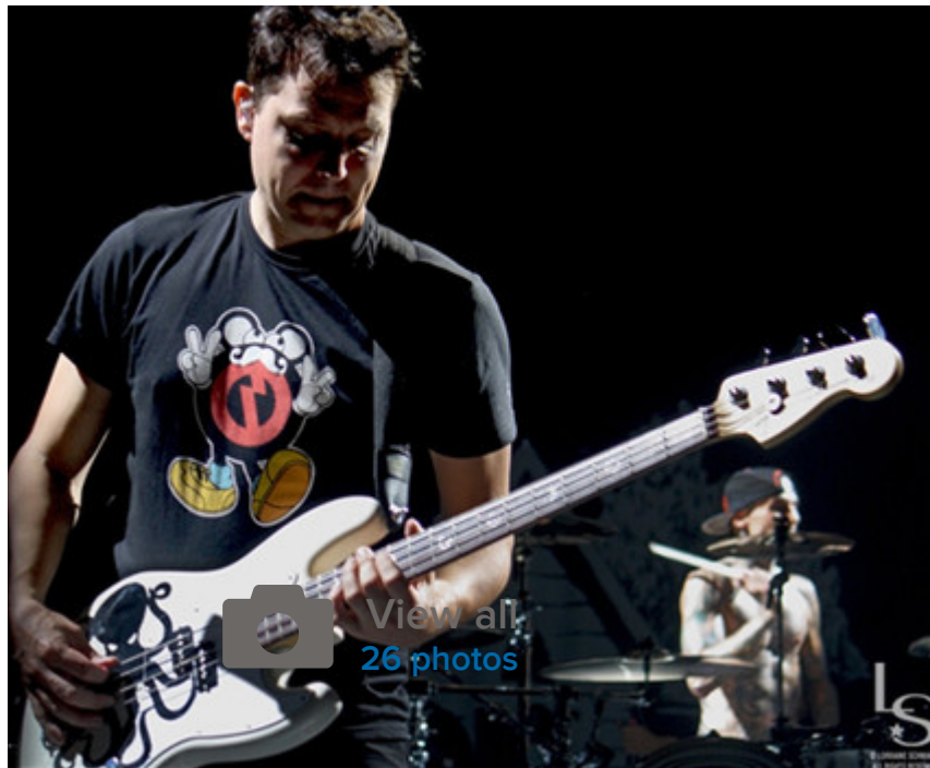
Blink-182 at 2011 Honda Civic Tour at Jones Beach