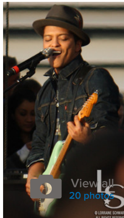
Bruno Mars at Bamboozle Festival 2011 Day 3

This past Sunday was the third and final day of the Bamboozle Festival, which took place at the Meadowlands sports complex from April 29 to May 1. The busiest of all three days, security was noticeably increased from Friday and Saturday to accommodate the mammoth crowd.