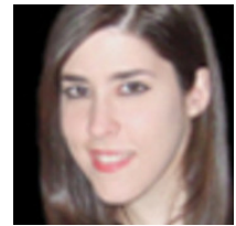
Lorraine Schwartz NY concert Examiner